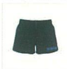
Ladies Shorts - $40