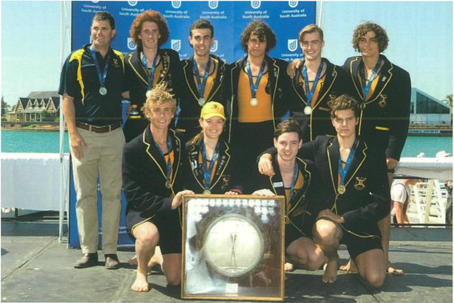
Winners of the Gosse Shield – School Boys First Eight 2015 – Scotch College