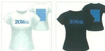
Ladies - T-Shirt - $40