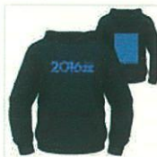
Hoodie Unisex - $70