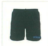
Mens Shorts - $40