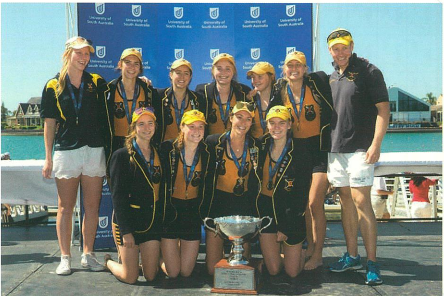
Winners of the Florence Eaton Cup – Girls' First Vills 2015 – Scotch College