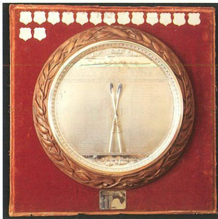
The Florence Eaton Cup for Schoolgirl 1 st Eights (First presented in 1988)