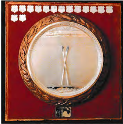
The Florence Eaton Cup for Schoolgirl 1 st Eights (First presented in 1988)