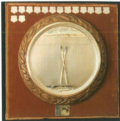
The Florence Eaton Cup for Schoolgirl 1 st Eights (First presented in 1988)