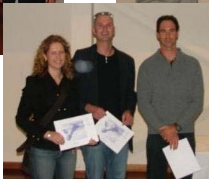
Some of the Award Winners