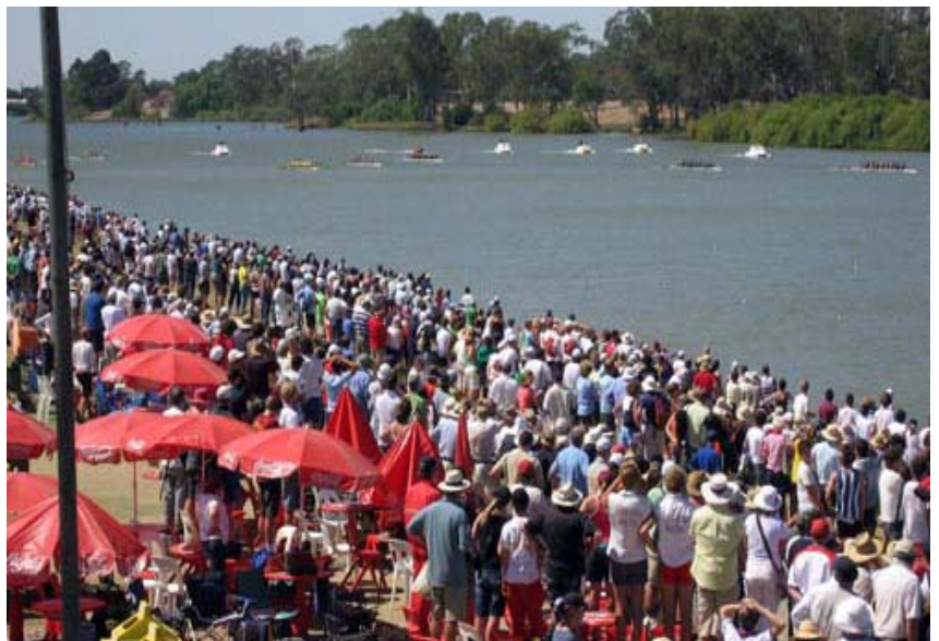
A large crowd was in attendance to witness the 2007 Interstate Regatta.