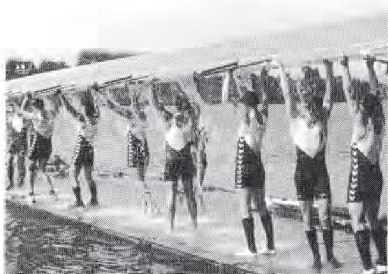
Showering after racing on Lake Karapiro