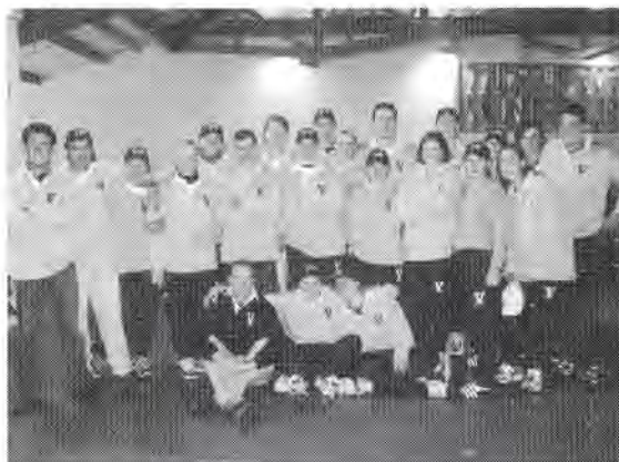
1999 Ausrowtec Junior Development Team

Lastly thank you to Ausrowtec for their ongoing support of development in Victoria. Their generous sponsorship gives many Victorian athletes the opportunity to further their rowing far beyond the school level.